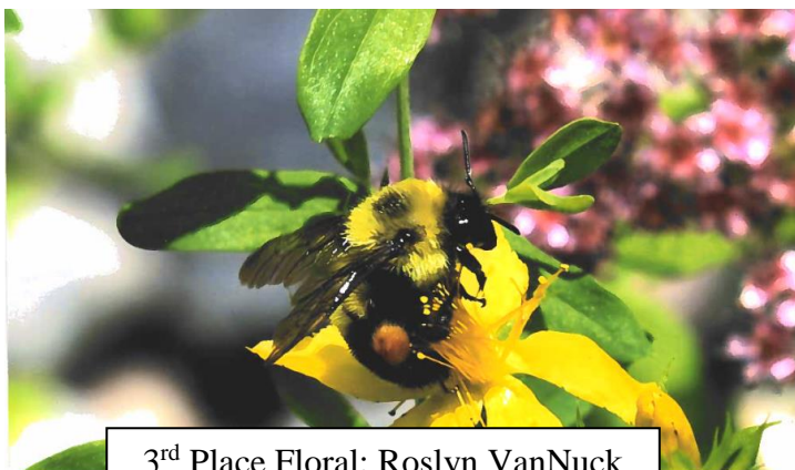
3 rd Place Floral: Roslyn VanNuck